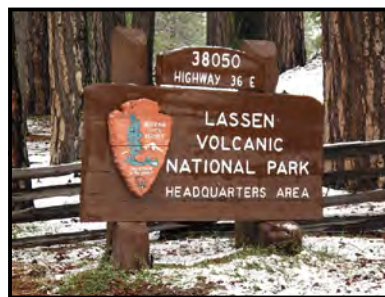
Headquarters Area Entrance Sign

The park highway is closed to vehicles in winter. Visit www.nps.gov/lavo to check on the status of park roads.